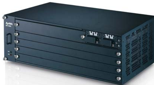
IES-5005 4U IP DSLAM with DC Power