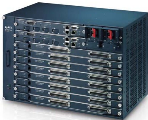
IES-5000 6.5U IP DSLAM with DC Power