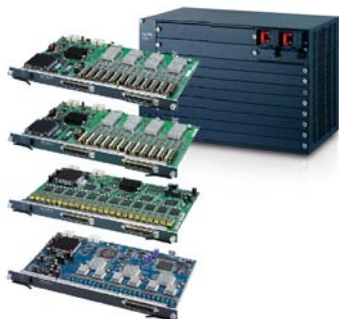
6.5U/4U IP DSLAM with DC Power