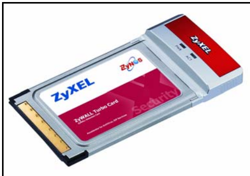
Figure 1 ZyWALL Turbo Card

Note: Turbo does not have a MAC address.