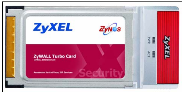
Figure 3 Turbo LEDs